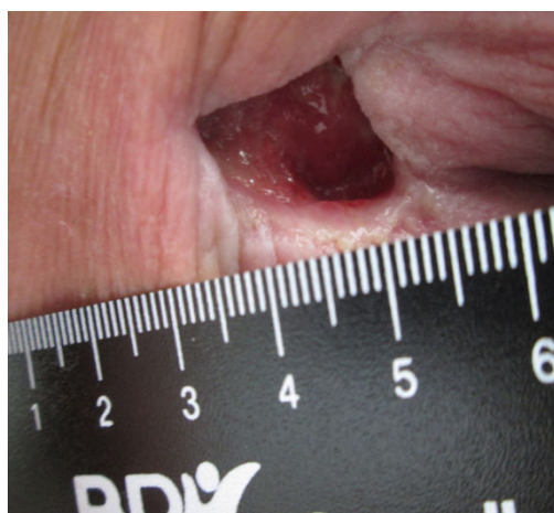
Figure 1: Wound at presentation.

physiological activity of the modalities of increasing local blood flow begins immediately and the healing follows quickly. Pressure ulcers are primarily metabolic in nature [18]. Older skin shows considerable atrophy and a prolonged and blunted healing response that can't adapt to the mechanical demands of an injury [19]. There is also heightened inflammation and differences in signal transduction, that result in inferior ECM production [20].