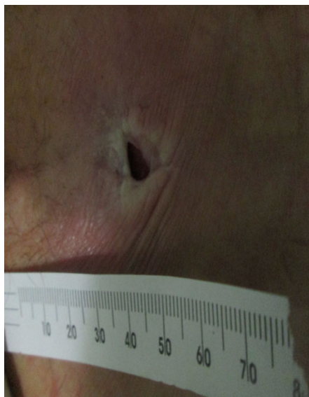
Figure 3: Wound after 20 weeks of treatment with CUSEFS.

An interesting result observed in the study was that PU's of the heels healed faster than those on other anatomic locations. The authors would like to suggest that there is a categorical difference between PU's on the heels and elsewhere on the body. Heel ulcers are significantly more akin to vascular ulcers than they are to metabolic ulcers. Whether this is true because of repetitive trauma through years of ambulation or the fact that distal, small vessels are more affected by age needs to be further evaluated.